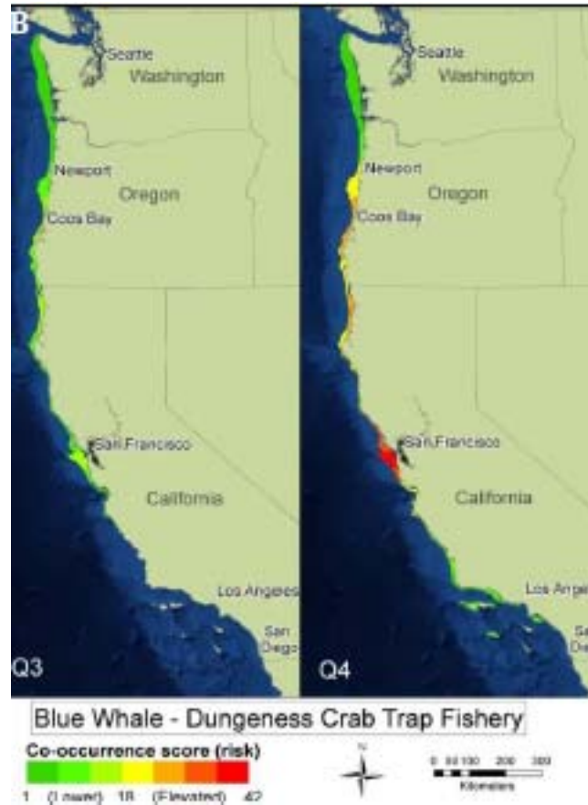
Figure 2. Co-occurrence of the multi-year average blue whale density and the Dungeness crab pot fishery shown for quarter three (July to September) and four (October to December).